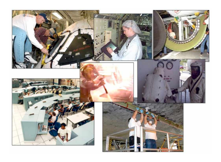
Figure 3. Examples of HSI opportunities for improvement in current ground crew operations.

processing that could adversely affect flight crew safety, public safety, and the safety of high-value national assets. Specific gaps for ground crews include: HSI design guidelines for unique ground support systems, upgrades to specialized personnel protective equipment supporting hazardous operations such as hypergolic propellant servicing, user-friendly interfaces between ground and flight systems such as quick-disconnects for fluid systems, and intelligent/adaptable procedure systems. Several ground crew HSI gaps are illustrated in Figure 3.